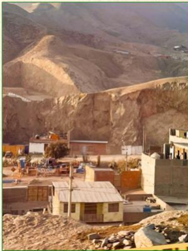
Over 10 million people live in Lima, Peru, a city built in a desert yet also on the Pacific coast. It is a city of great diversity...geographically, economically, and spiritually.